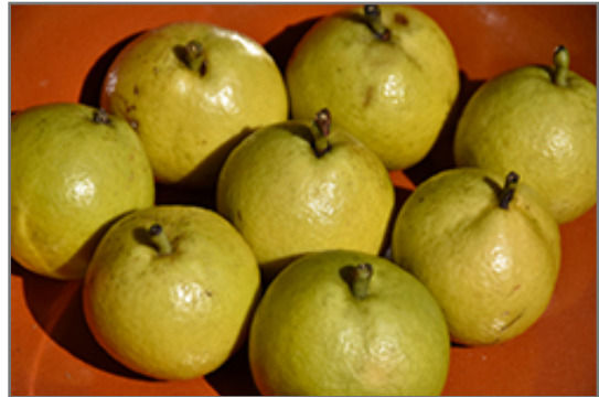
Golden Spice Pear fruit