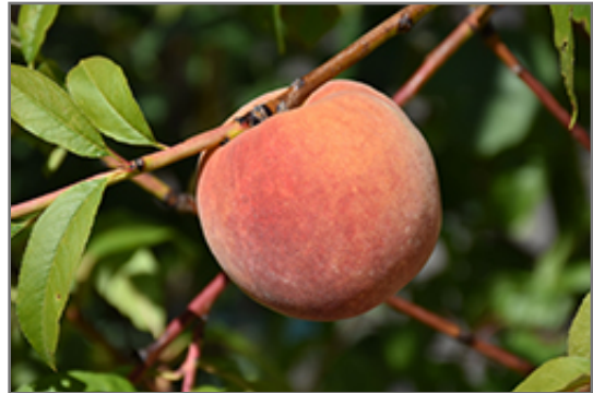
Redhaven Peach fruit

Redhaven Peach is covered in stunning clusters of fragrant pink flowers along the branches in early spring, which emerge from distinctive rose flower buds before the leaves. It has dark green deciduous foliage. The narrow leaves turn yellow in fall. The fruits are showy yellow drupes with a red blush, which are carried in abundance in mid summer. The fruit can be messy if allowed to drop on the lawn or walkways, and may require occasional clean-up.