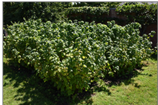
Black Currant