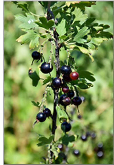
Black Currant fruit

Aside from its primary use as an edible, Black Currant is suitable for the following landscape applications;