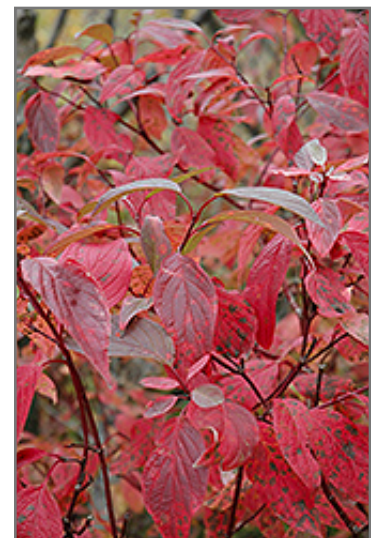
Red Osier Dogwood in fall