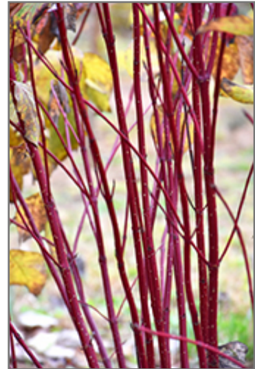
Red Osier Dogwood stems

Red Osier Dogwood is recommended for the following landscape applications;