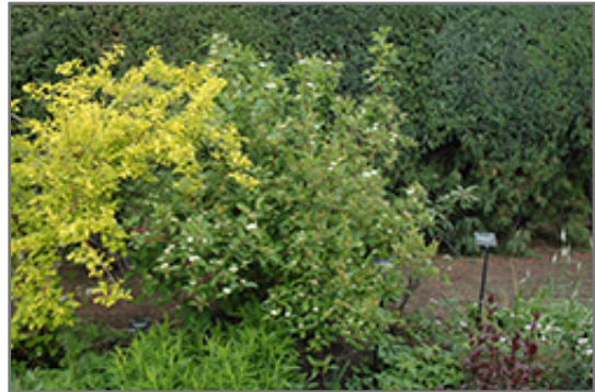
Red Osier Dogwood

This shrub does best in full sun to partial shade. It is an amazingly adaptable plant, tolerating both dry conditions and even some standing water. It is not particular as to soil type or pH. It is highly tolerant of urban pollution and will even thrive in inner city environments. This species is native to parts of North America.