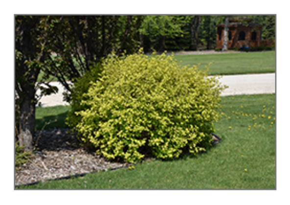
Nugget Ninebark